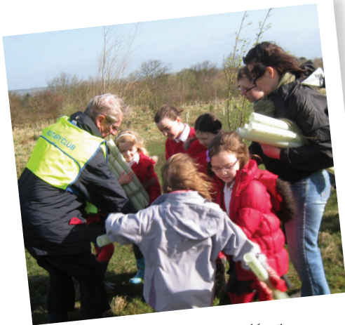
Western tree planting

You can help create a massive movement for change by making Climate Week happen where you are. Get your Rotary Club to organise an event or encourage other community groups and/or local schools to run an event during Climate Week – March 12-18 2012.