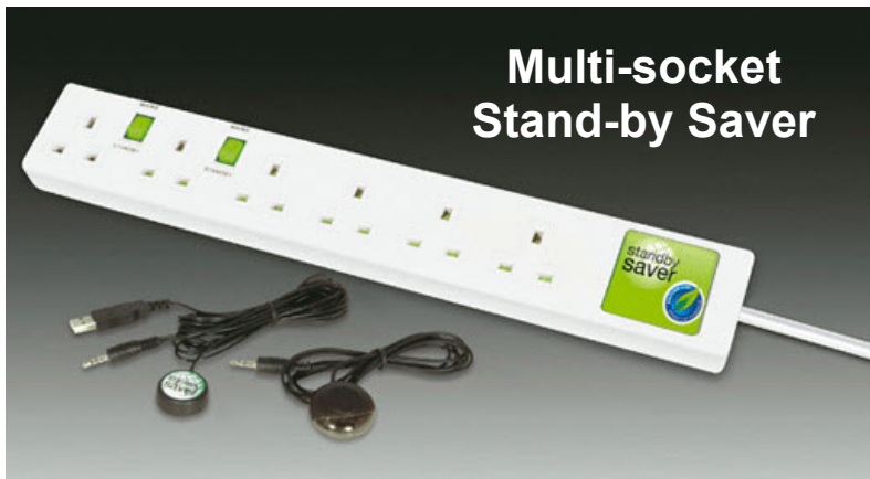
Multi-socket Stand-by Saver

Email the Trust at info@TheSustainabilityTrust.org with your Club order