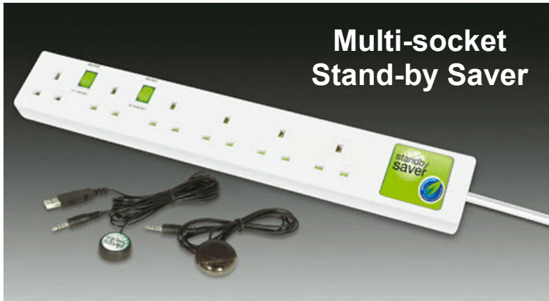
Multi-socket Stand-by Saver